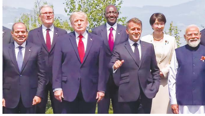
Emmanuel Macron. "They are all well-known figures, right? The heads of countries -- we had a couple of others in there too, as you know. Some, like, as an example, PM Modi of India - great guy. A lot of people came. They are

"I walked in there, these leaders, and I just looked at them. I said, 'I'm the boss'. And you know that was done as a joke. This thing got carried all over the world. I can't believe it. I was just being cute, funny. I wasn't trying to be the boss," he further said. Trump concluded by saying that the G7 Summit was "tremendous" and "very dominant". Trump said he "got what he wanted".