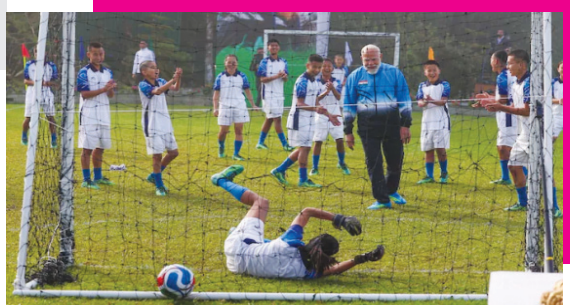
"Nothing like playing some football with my young friends in Sikkim on a lovely Gangtok morning!" PM Modi wrote on Facebook while sharing some pictures of himself in action on the football field.

Remember the image of Chief Minister Mamata Banerjee sitting in a wheelchair and throwing a football at a rally in Bengal during the 2021 assembly elections amid chants of "Khela hobe". The slogan resonated across different sections and proved to be a rallying cry for the TMC as it won a decisive two-thirds majority. Posting images on X, PM Modi described it as an "energising" football session with youngsters.