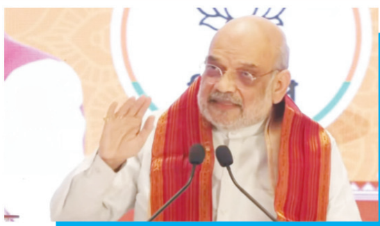
comment. Shah had alleged that her "goons" did not allow voters to vote, but the turnout was large in the first phase of polls on April 23. He had added that the BJP will win at least 110 of the 152 seats

Banerjee had reportedly indicated legal action against Shah over his "hang upside down"