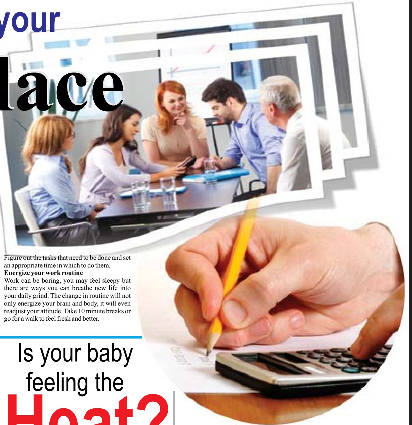
Figure out the tasks that need to be done and set an appropriate time in which to do them.

In order to have a more organized, balanced work style, you need more time. We can't control how many hours are in a day, but successful people spend their time wisely.