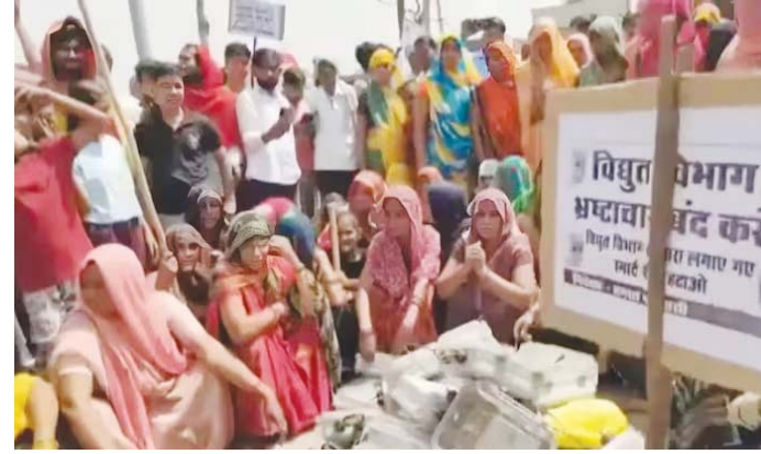
smart meter rollout in Uttar Pradesh into a policy that is generating more heat than light. balance.

Taking note of the mounting complaints against discoms for allegedly forcing consumers to switch to pre-paid smart meters, the Uttar Pradesh Electricity Regulatory Commission (UPERC) has stepped in. The regulator on Sunday directed the state's parent DISCOM, Uttar Pradesh Power Corporation Limited (UPPCL), to submit a detailed report within 10 days. The Uttar Pradesh government on Sunday said that electricity would not be disrupted for three days even after smart meters, which are soon to be installed, run out of