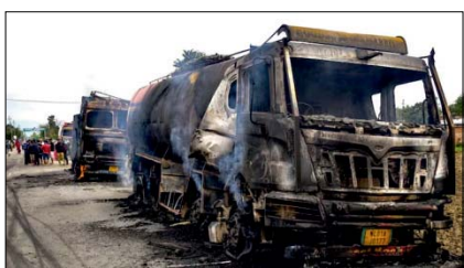
Mobile internet shut down in Imphal, 4 other Manipur districts after 2 children killed in likely rocket attack